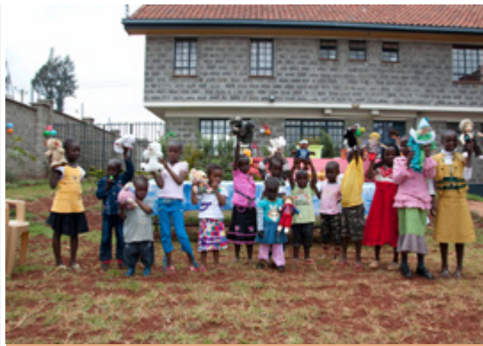
14 new children at MMH