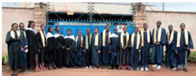
The graduating class 2014