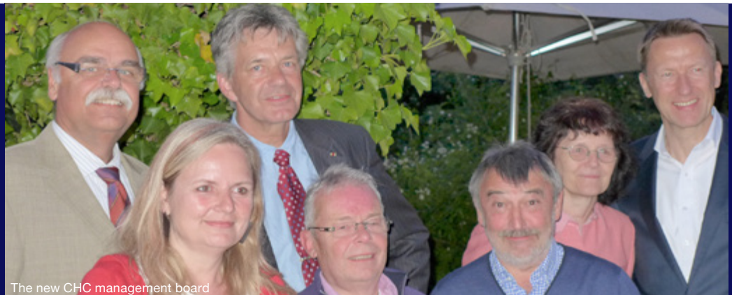
The new CHC management board