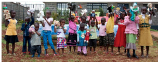
New kids at MMH