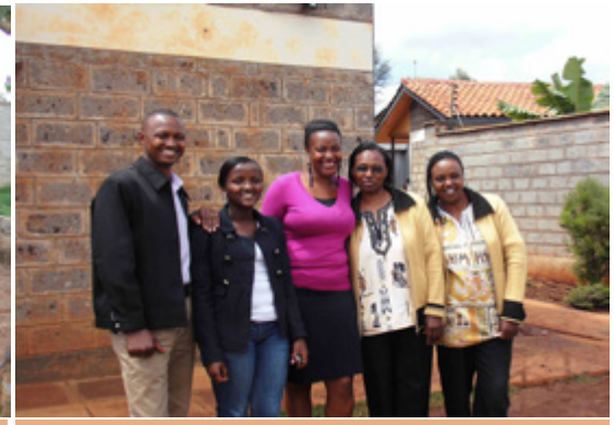
Always here for the children