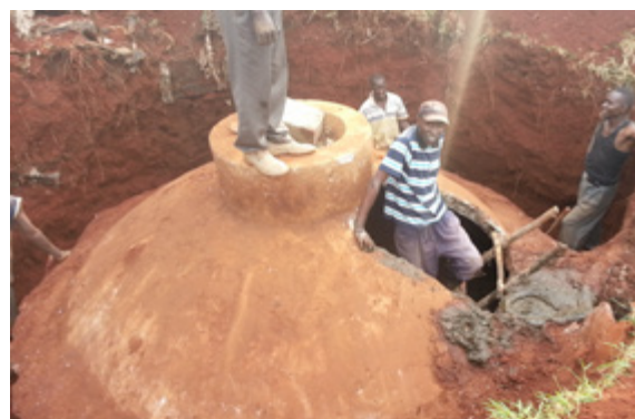
Final works at the bio gas plant

The functionality of the kitchen will be tested and, as soon as sufficient bio-gas can be produced, it will start proper operations. With the implementation of the new kitchen, cooking on the wood fire in the old MMH kitchen will soon become history. The process, whilst being rather photogenic, generated a lot of smoke and was therefore environmentally unfriendly.