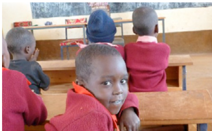
In the classroom

The now finished Primary School building was accepted as complete on 21.11. Apart from two missing drainpipes and windows that did not close well, there were no large issues to note in the building. The necessary adjustments will soon be made and school operations can begin with the start of the new school year in January. Until then, thanks to a generous donation from the Kröner Stiftung, we will be organising school furniture, uniforms and an initial supply of training material and stationery. Final acceptance will take place at the end of the contract, in May 2014.