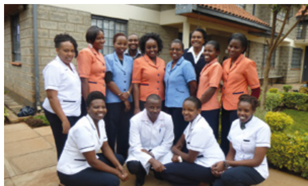
The Medical Center Team

In the spring, we want to take our local team on a trip to