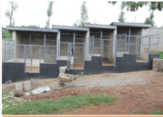
The new stables