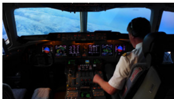
Within the Simulator

We wish everyone success and heartfelt thanks for drawing attention to our cause.