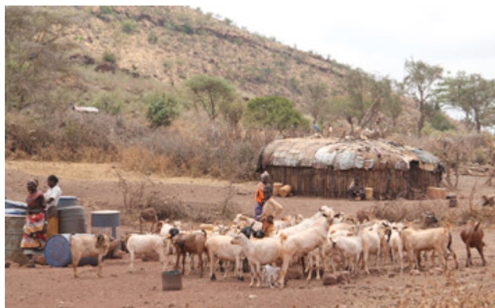
Village near Karare

Unfortunately, not all children are yet sent to school by their parents. Hopefully, due to the two schools constructed by CHC, in the long-term, more and more children from the surrounding area will have the chance to attend school.