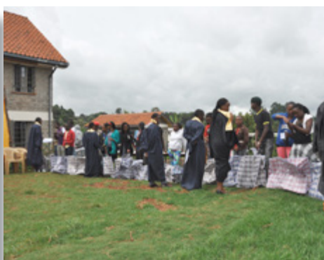
Distribution of the Leavers Kits