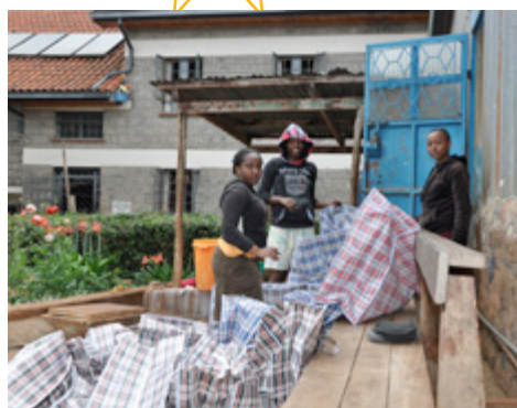
The Leaver Kits are packed